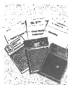
Some of the course materials supplied by Home Studies Division

In conjunction with James Bennett Pty Ltd of Australia and with the cooperation of local publishers and their agencies, the group is able to supply books to libraries in Singapore and Malaysia at attractive prices and with the minimum of delay. With its telex link, it can secure urgent requirements speedily. The Group is registered with the Ministry of Education, Singapore as a library supplier to all primary and secondary schools as well as to junior colleges.